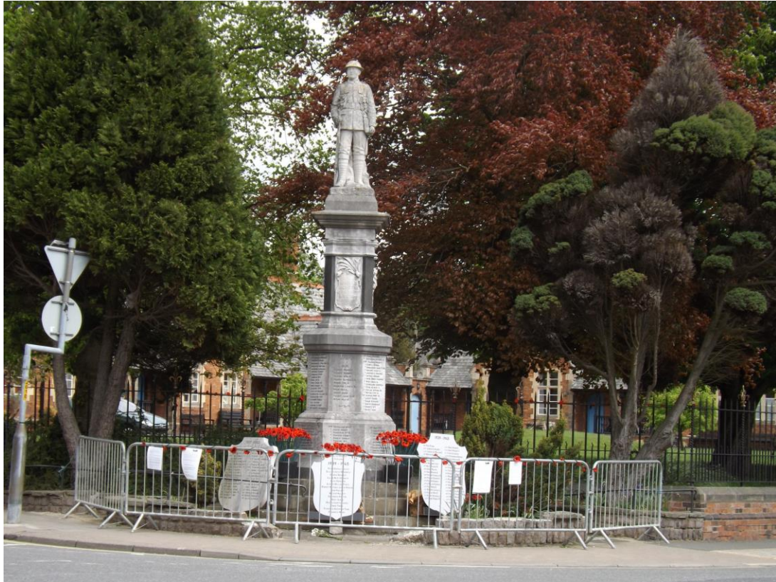
Louth War Memorial