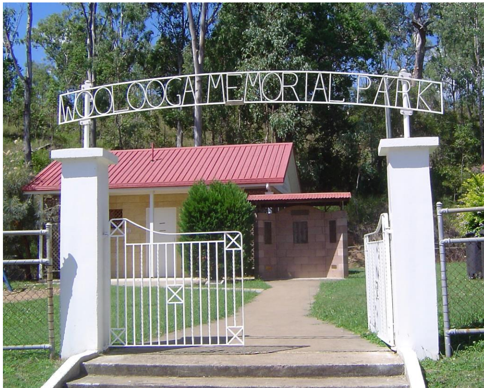
Woolooga Memorial Park