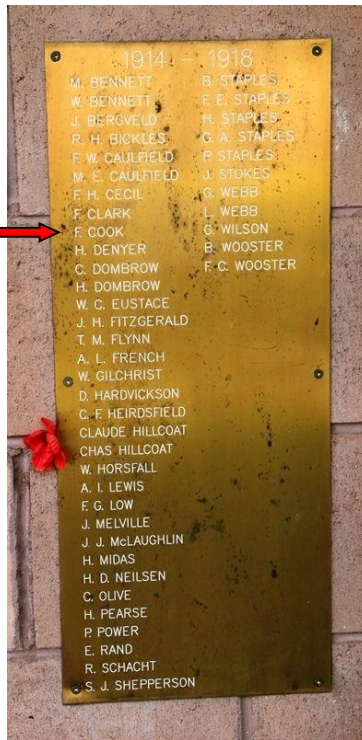
F. Cook is remembered on the Woolooga and District Roll of Honour, located in the Woolooga Community Hall, Bauple - Woolooga Road, Woolooga, Queensland.