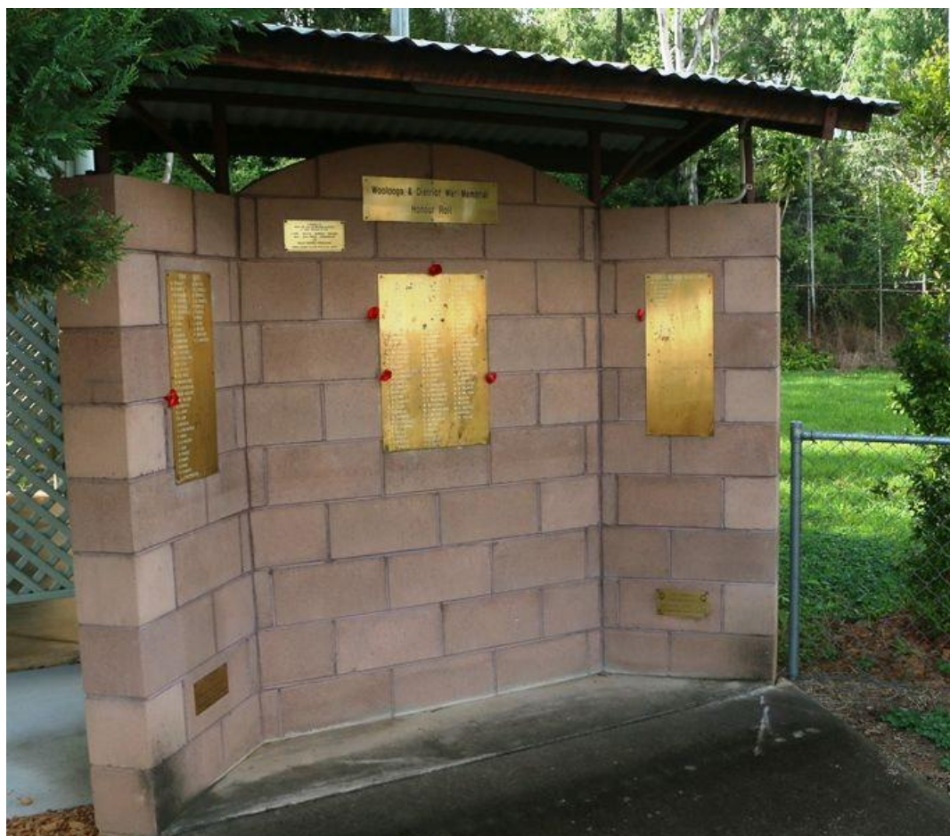
Woolooga & District War Memorial